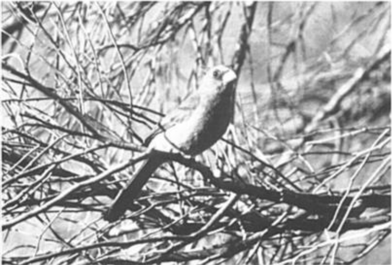
Figure 10. Female Pyrrhuloxia, Cardinalis sinuatus (1995-056), Chemehuevi Wash, San Bernardino Co., 29 May 1995. Three males were also present.