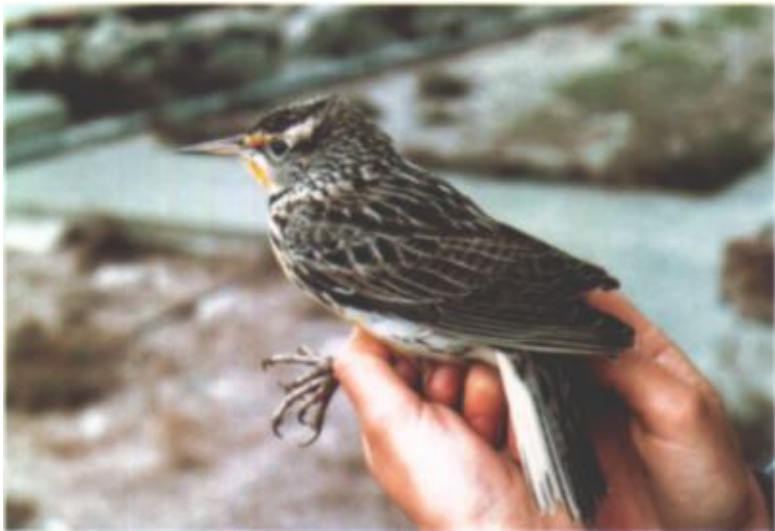
Figure 11. This meadowlark, Sturnella sp. (1989-011), was captured and photographed on Southeast Farallon I., San Francisco Co., 29 October 1985, and submitted as a possible Eastern Meadowlark ( S. magna ). Fresh-plumaged Western Meadowlarks ( S. neglecta ) may lack significant yellow in the malar region and can be unusually dark above; a consensus of CBRC members and outside experts was this individual was likely a Western.

EYEBROWED THRUSH Turdus obscurus . A report from William Heise County Park, near Julian, SD, 19 Feb 1995 (1995-144) lacked detail sufficient for a potential