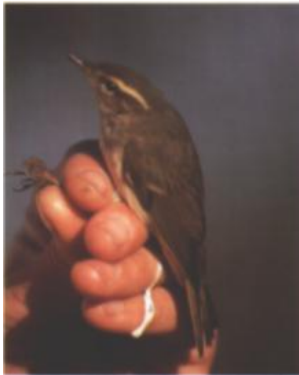
Figure 6. Arctic Warbler, Phylloscopus borealis (1995-106), Big Sur River mouth, Monterey Co., 13 September 1995. The very long supercilium, mottled auriculars, and long primary projection helped identify this species, a first for California.