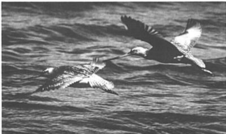
Figure 2. Bar-tailed Godwit, Limosa lapponica (1995-105), in flight (on left) with a Marbled Godwit, L. fedoa , at Abbott's Lagoon, Pt. Reyes National Seashore, Marin Co., 12 October 1995.