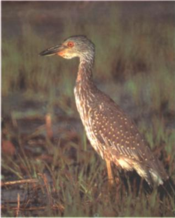
Figure 1. This Yellow-crowned Night Heron, Nyctanassa violacea (1993-035), near Pt. Mugu, Ventura Co., 4 September 1995, is one of the few in first-year plumage to be found in California. Note the stout, dark bill and long-legged appearance.