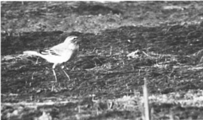
Figure 8. Yellow Wagtail. Motacilla flava (1996-006), Lake Earl, Del Norte Co., 29 August 1995.