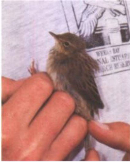
Figure 5. Lanceolated Warbler, Locustella lanceolata (1996-014), Southeast Farallon I., San Francisco Co., 11 September 1995. Only the second record for North America.