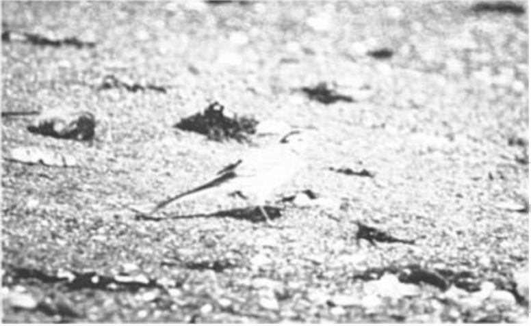
Figure 9. Black-backed Wagtail, Motacilla lugens (1995-117), in first basic plumage, Bolinas, Marin Co., 3 November 1995.