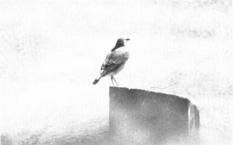
Figure 7. Northern Wheatear. Oenanthe oenanthe (1995-127), Baker Beach, San Francisco. 23 September 1995.