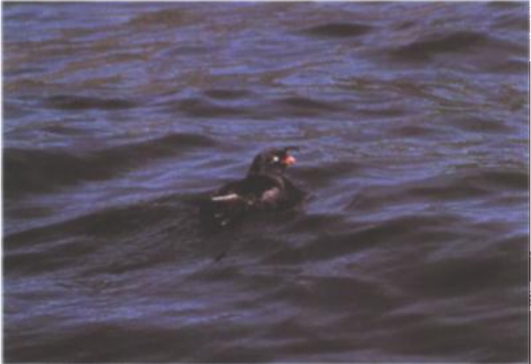
Figure 4. Crested Auklet, Aethia cristatella (1995-069), just off Bodega Head, near Bodega Bay, Sonoma Co., 26 June 1995. This makes the second record for California; the first was of a beached bird in Marin Co. in 1979.