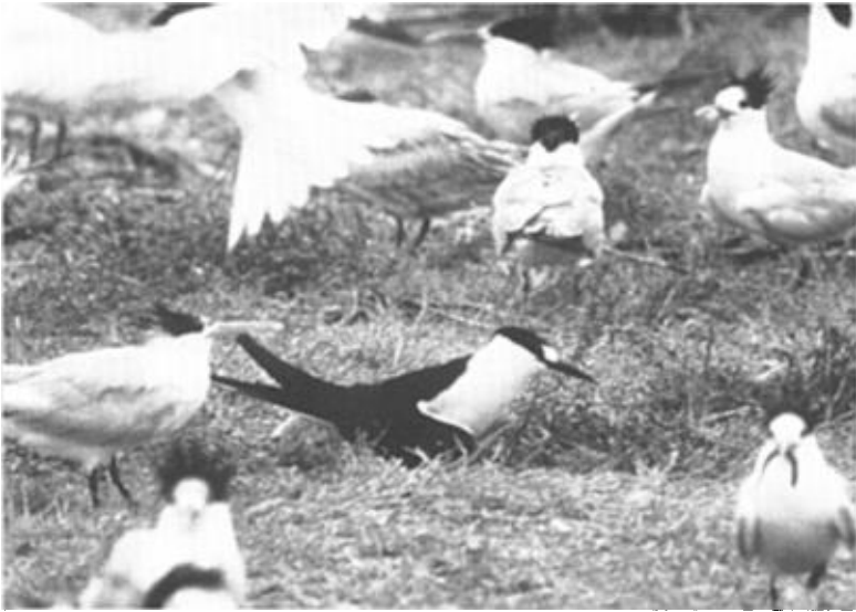
Figure 3. Sooty Tern, Sterna fuscata (1995-070) among Elegant, S. elegans , and Royal, S. maxima , terns at Bolsa Chica, Orange Co., 15 July 1995; an adult Sooty Tern has been present at this location each summer since at least 1994.